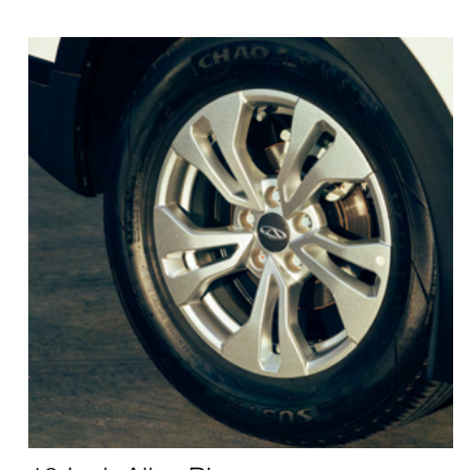
16-Inch Alloy Rims

When it comes to the TIGGO 4 Pro Panel Van, you'll find the sleek waistline, chic Halogen Headlamps and striking Diamond-Shaped grille are the equivalent of a sharp suit and a power tie. It's aerodynamic lines cut through the air with effortless grace, complementing its bold presence. Designed to impress, the TIGGO 4 Pro Panel Van is where style meets substance and first impressions last.