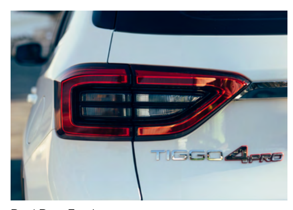
Dual Rear Fog Lamps